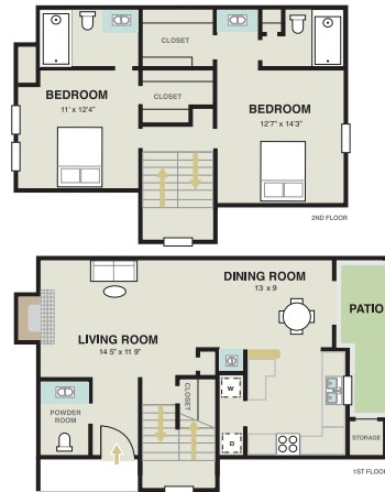
2 Bedroom / 2.5 Bathroom 1236 Square Feet