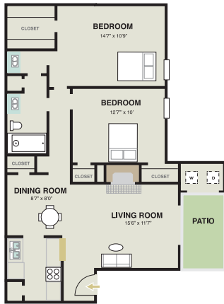
2 Bedroom / 1 Bathroom 899 Square Feet