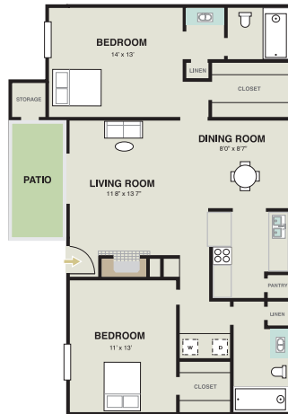
2 Bedroom / 2 Bathroom 1000 Square Feet