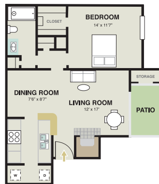
1 Bedroom / 1 Bathroom 689 Square Feet