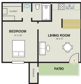
1 Bedroom / 1 Bathroom 505 Square Feet

Check out our floor plans, give us a call and schedule a tour today. One of our dedicated staff members would love to show you around.