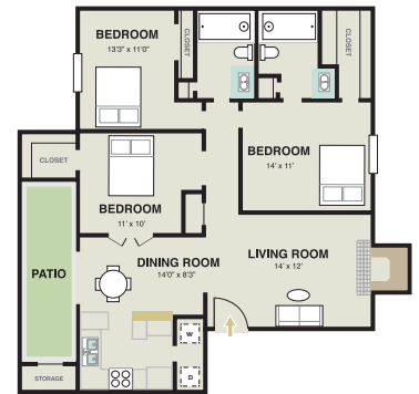
3 Bedroom / 2 Bathroom 1152 Square Feet