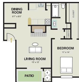
1 Bedroom / 1 Bathroom 733 Square Feet